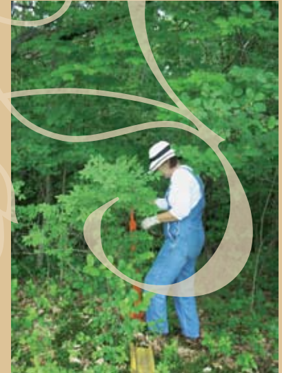
Cover photo was taken at Greensboro Ridge Natural Area