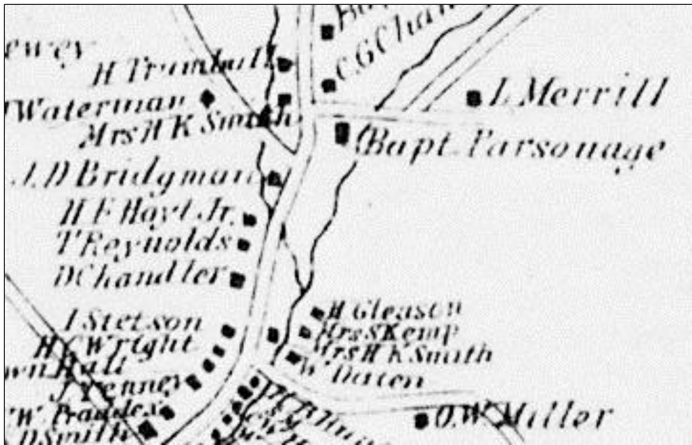
Etna Village and Storrs Farm area in 1892