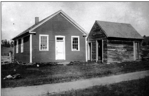
#4 Schoolhouse; Knapp Road in foreground