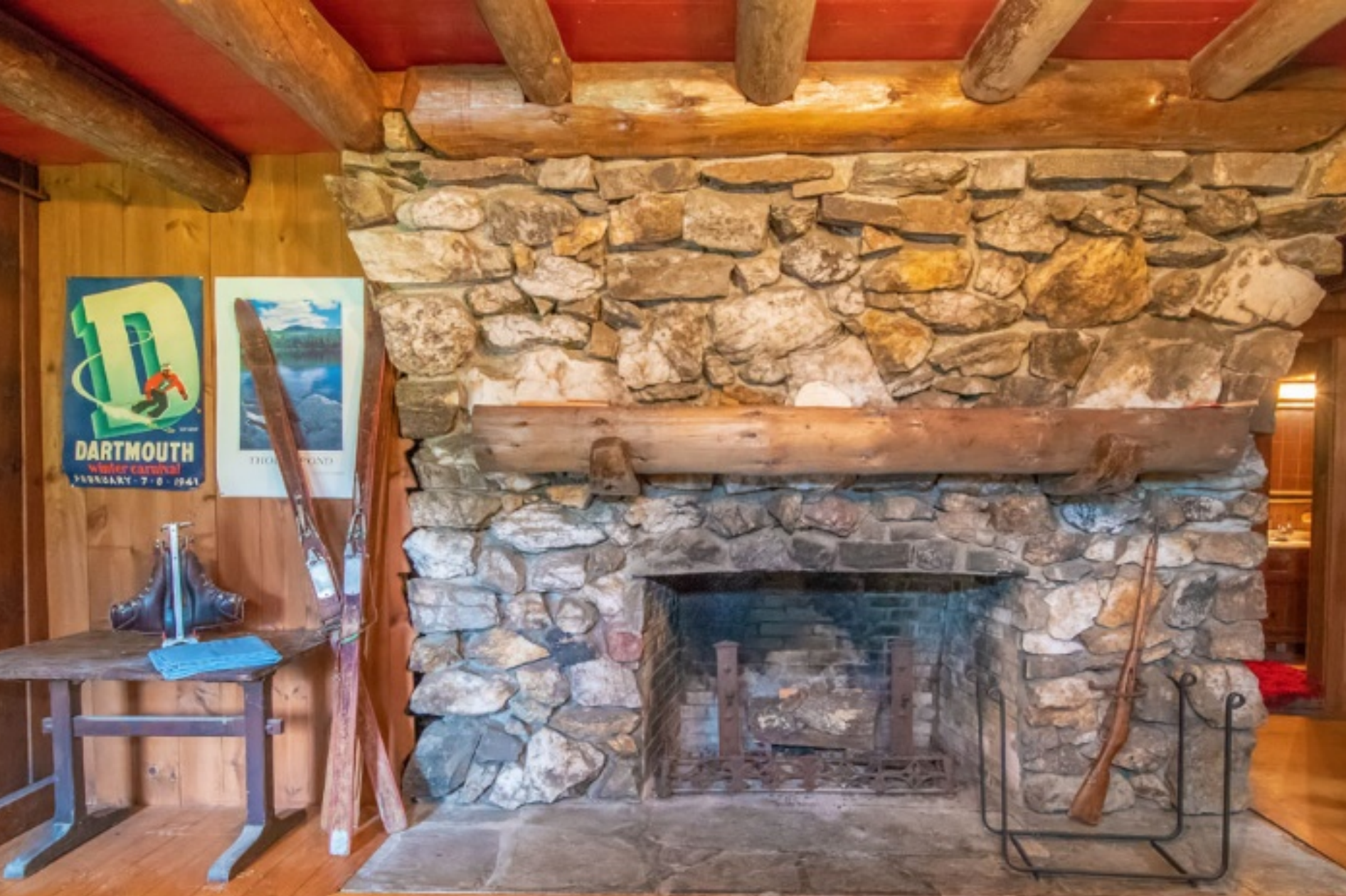
Downstairs bar room