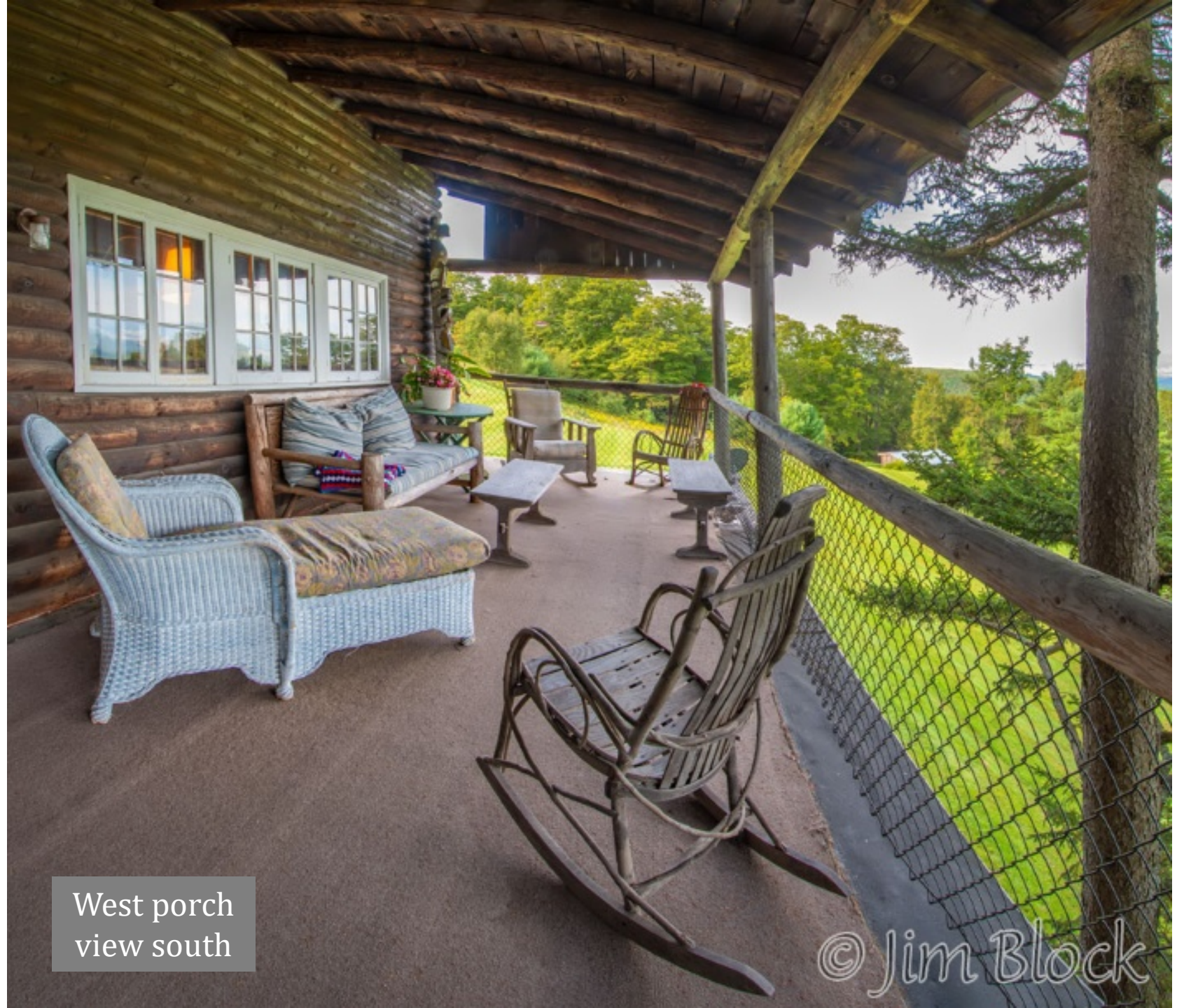
West porch view south