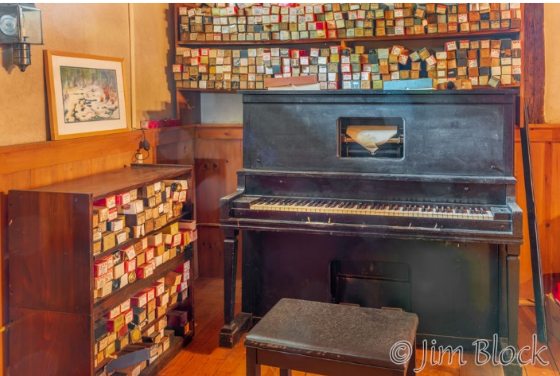
Player piano in the downstairs bar room